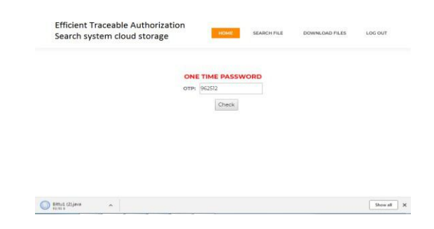
Fig -8: File Download