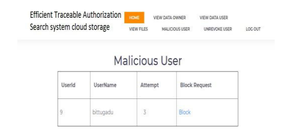
Fig -5: Malicious User Blocking