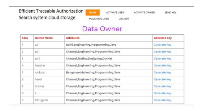
Fig -2: Owner activation