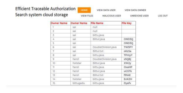
Fig -4: File Information