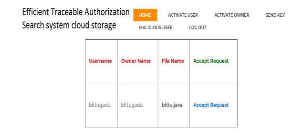
Fig -3: Sending keys