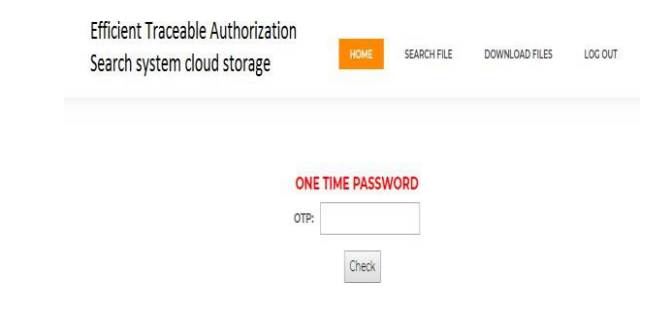
Fig -7: OTP