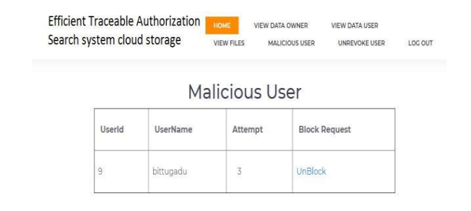
Fig -6: Malicious User unBlocking